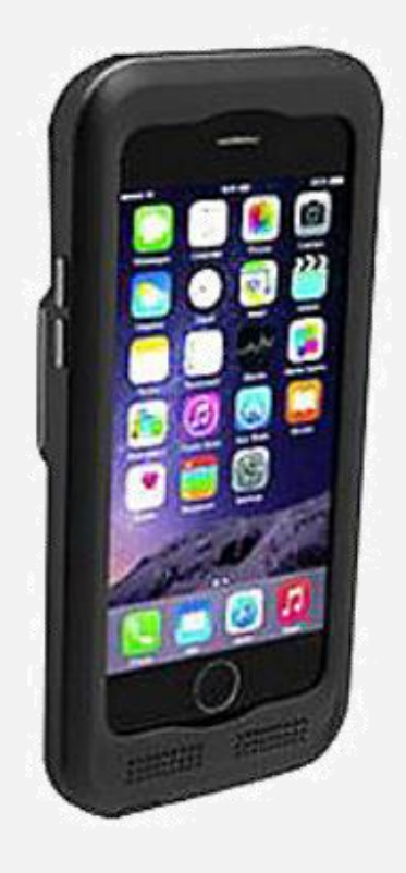
HONEYWELL CAPTUVO SLED